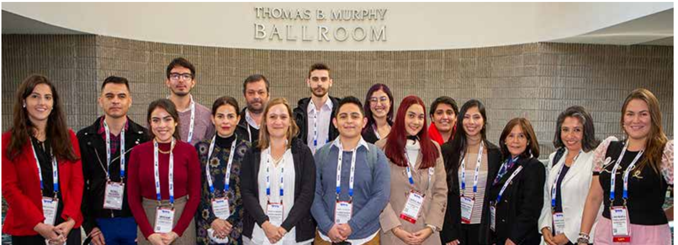
International students attending the 2022 Latin American Poultry Summit