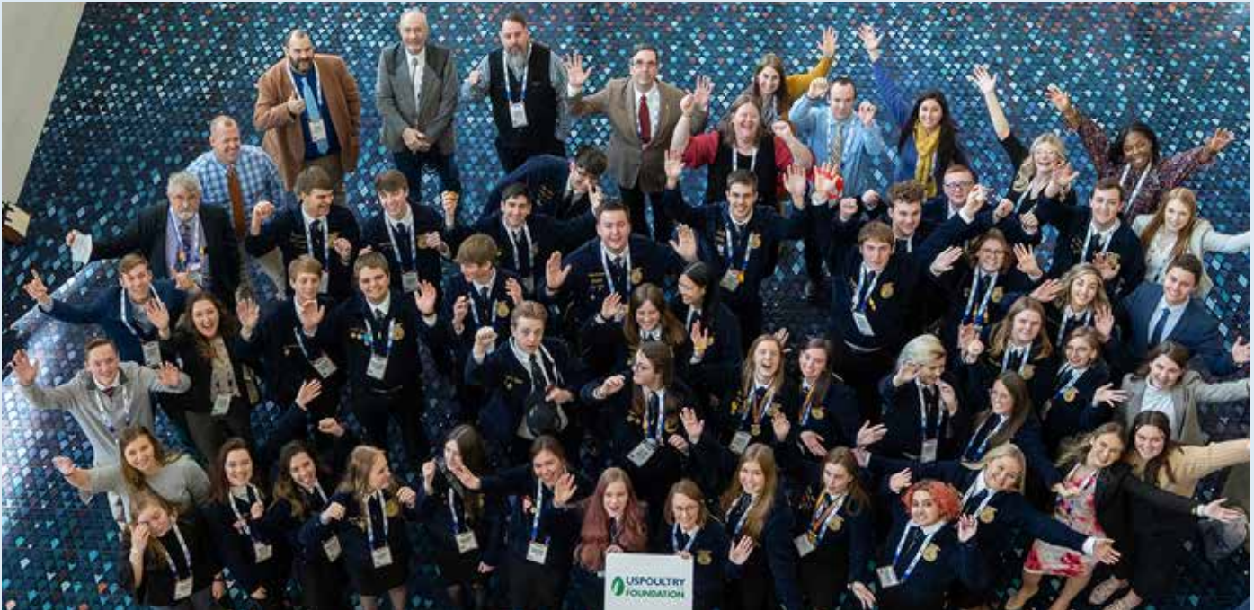
FFA students and advisors at the 2022 IPPE

As college students, they were provided the opportunity to participate in the USPOULTRY Foundation's College Student Career Program to interview for internship opportunities with poultry and egg industry member companies and exhibitors. The students were also able to explore the vast trade show floor to see the exciting technology used by today's modern, sustainable poultry industry.