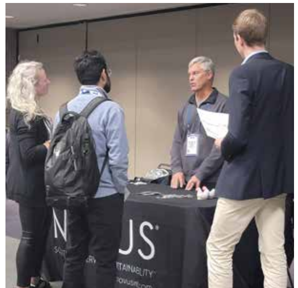
Ph.D. and vet students participating at the Ph.D. and Vet Student Career Fair