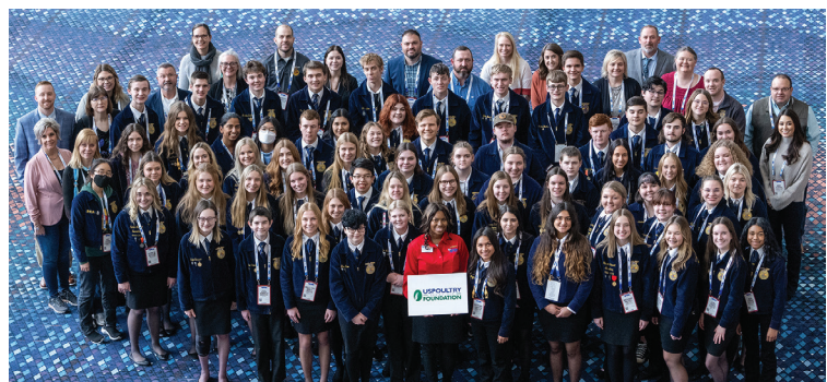
FFA students and advisors at the 2023 IPPE.

The following Food Science and Technology CDE teams were invited to attend IPPE: Missoula FFA, MT; Big Walnut-DACC FFA, OH; Lake Butler FFA, FL; Florence FFA, TX; Bergen County Academics FFA, NJ; Cache FFA, OK; Dassel-Cokato FFA, MN; Mandan FFA, ND; Monroe City FFA, MO; and Galt-Liberty Ranch FFA, CA.